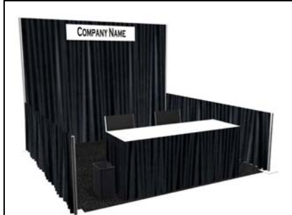
10 x 10 booth display